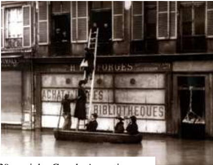
29, quai des Grands Augustins

Each overflow of the Seine surprises us. In particular, the DIREN (French Environmental Protection Agency) has conceived several flood scenarios for prevention purposes. In addition, numerous facilities have been put under close watch, particularly the Louvre whose underground reserves have been moved.